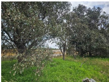
Plate 4. Trees in the project area