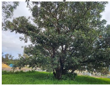
Plate 2. Trees in the project area