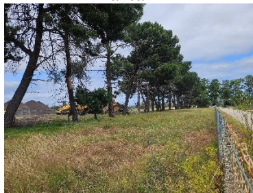
Plate 5. Trees in the project area