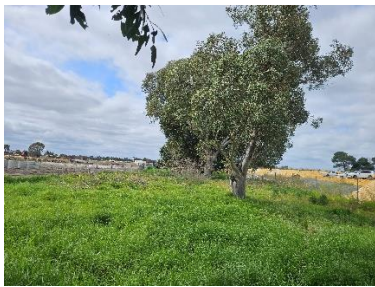
Plate 1. Trees in the project area