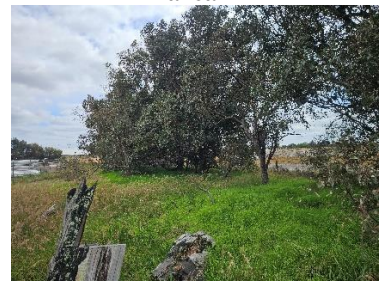
Plate 6. Trees in the project area