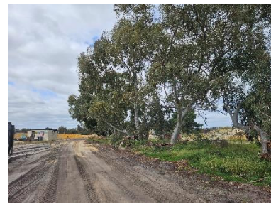
Plate 3. Trees in the project area