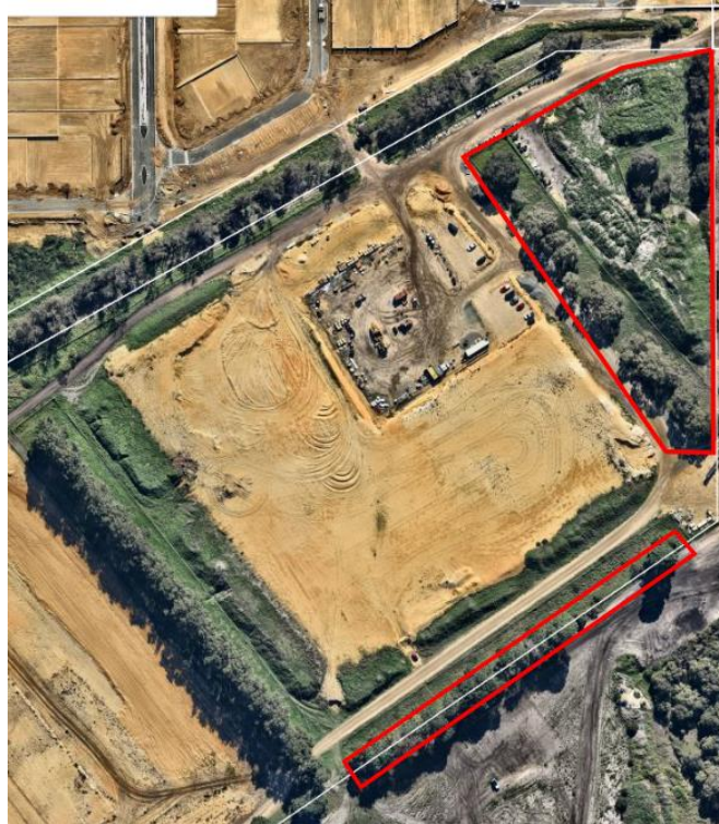
Figure 1. Project area